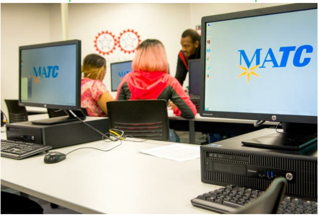
CLICK HERE FOR A COMPLETE LIST OF SERVICES

For more information, call America Works at (414) 302-2668 Located at: 816 W. National Ave., Milwaukee, 53204